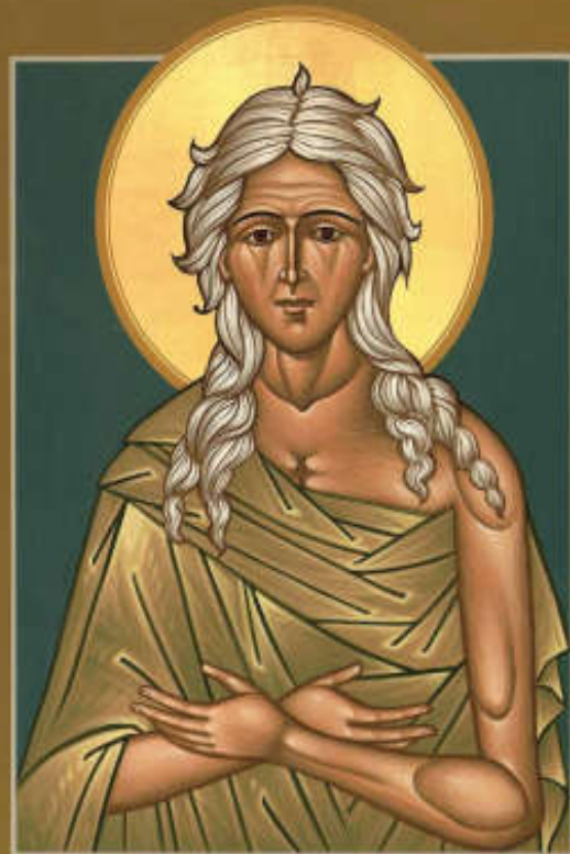
ST. MARY OF EGYPT

Greek Orthodox Metropolis of Denver Denver, CO