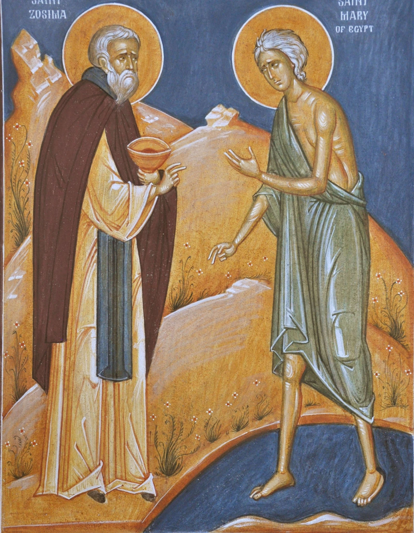
SAINT MARY OF EGYPT