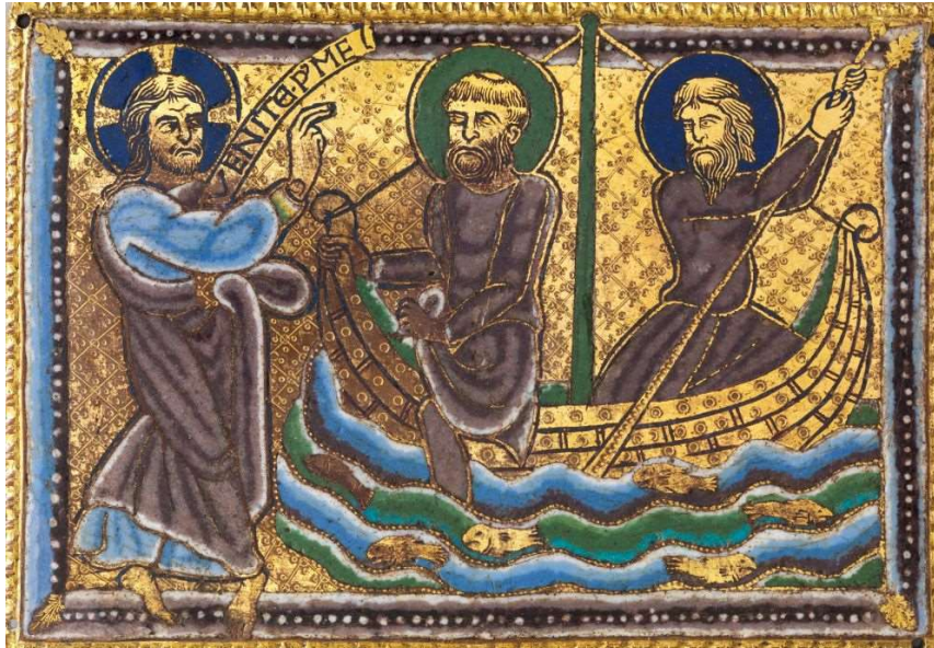
The Gospel According to St. Matthew (с.4, v. 18-23)

God gives vengeance unto me, and subdues people under me! · He magnifies the salvation of the king, and deals mercifully with Christ, with David and his seed forever