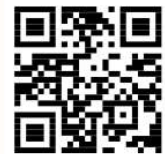
Amazon Holiday Goodie Bag Wish List